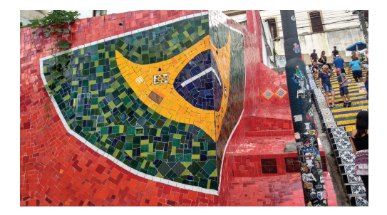
"Escadaria Selarn, also known as the 'Selaron Steps', is a set of world-famous steps in Rio de Janeiro, Brazil." -Wikipedia

Quick! Name that quadrennial event celebrating excellence and wonder which brings hundreds of nations to a select summer destination, say, Rio de Janeiro, Brazil! While the Summer Olympics is a great answer, consider the International Congress of Mathematicians (ICM), which took place August 1 - 9 in Rio and is the world's largest international math conference.